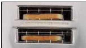
Extra-wide and extra-deep slots – automatically centres the bread slices