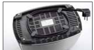
Cord storage in the bottom

The on/off handle only engages in the toasting position (LIFT & LOOK), if the toaster is connected to the power supply and switched on. After the desired toasting time elapsed, a beep sounds and the toaster automatically switches off and the on/off handle moves back to the idle position. There is no need to keep a watch on the toasting process. You may cancel the toasting process at any time, pressing the CANCEL button.