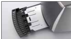
Crumb tray – simply pull out the tray to remove crumbs